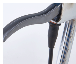
Slow release handle