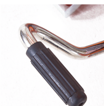
Manually operated via pump action foot pedal