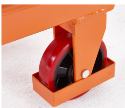
Swivel castors close Up